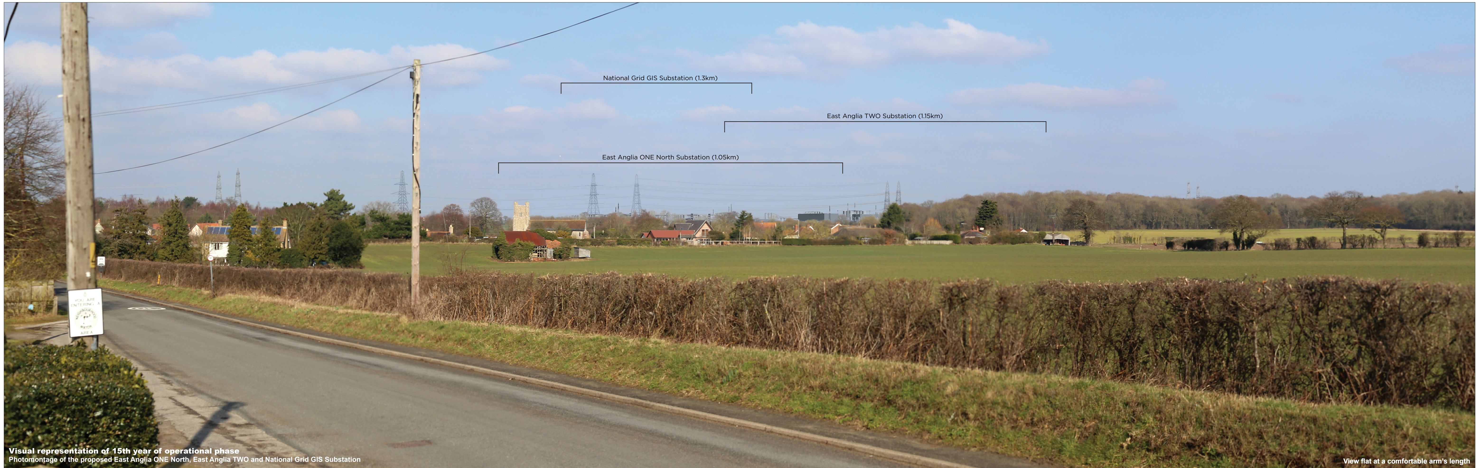
Visual representation of 15th year of operational phase Photomontage of the proposed East Anglia ONE North, East Anglia TWO and National Grid GIS Substation