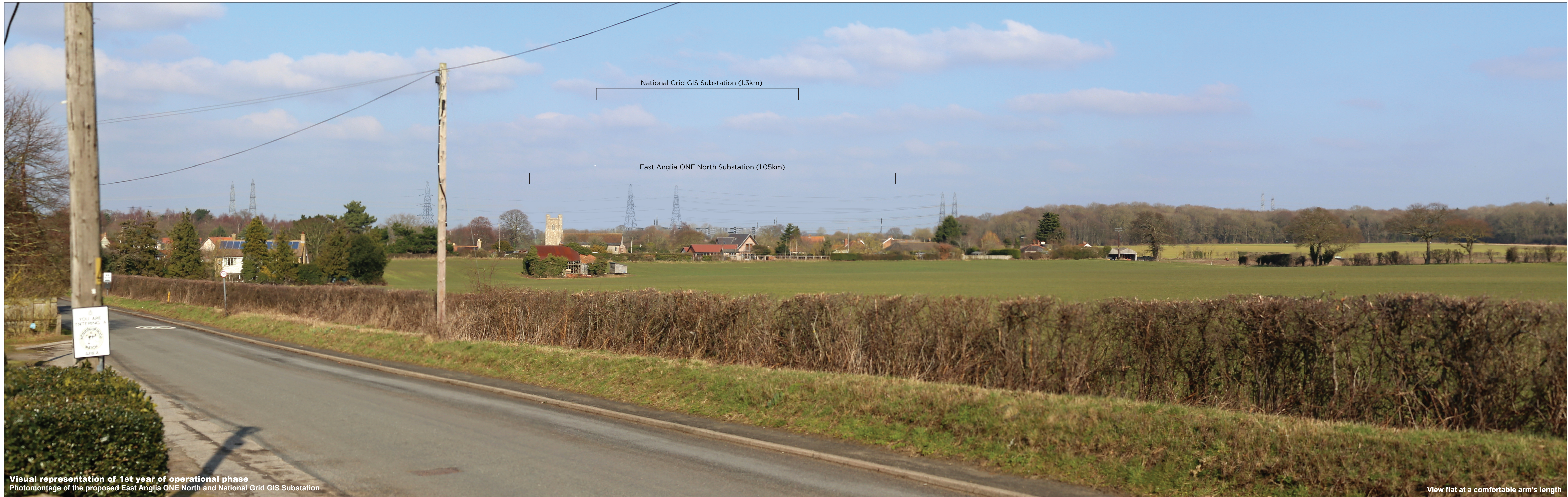
Visual representation of 1st year of operational phase Photomontage of the proposed East Anglia ONE North and National Grid GIS Substation